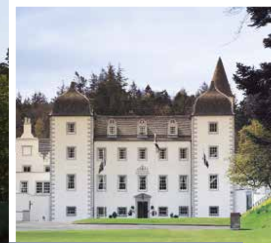
[Left and above] Surrounded by 25 acres of grounds, Barony Castle Hotel would work well for an outdoor ceremony in front of the gleaming white castle, under the forest canopy or at the l6th-century altar